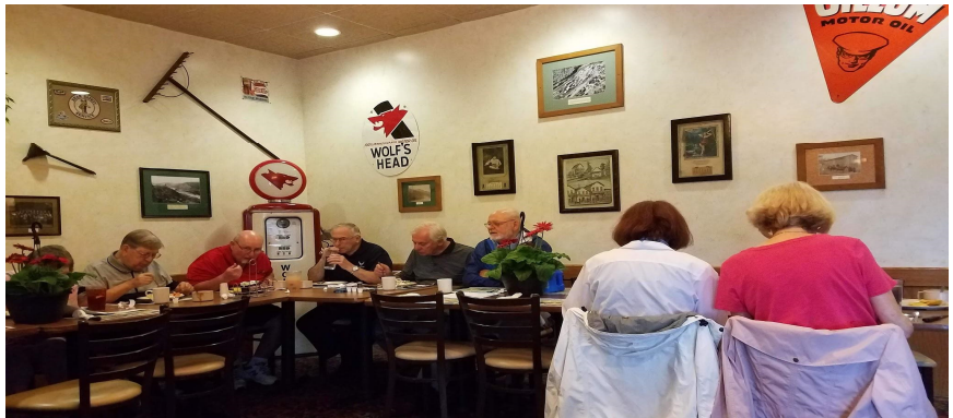
June meeting at Hoss's