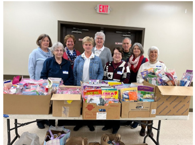
Pictured Above: PASR Region 7 Executive Board with donations from their 2022 Veteran Project